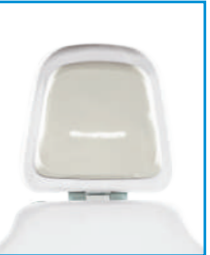
C95 Gel Appeal

Magnetic Gel Appeal Pillow adapts to the physical structure of every person, absorbs and distributes head and instrument pressure over the entire contact surface. Long and pleasant sensation of freshness during treatment.